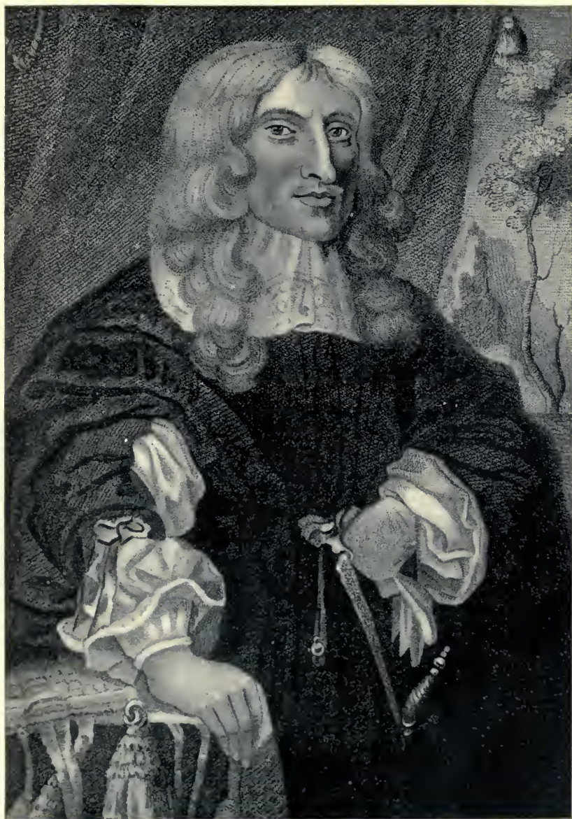
WILLIAM CUNNINGHAM Ninth Earl of Glencairn,